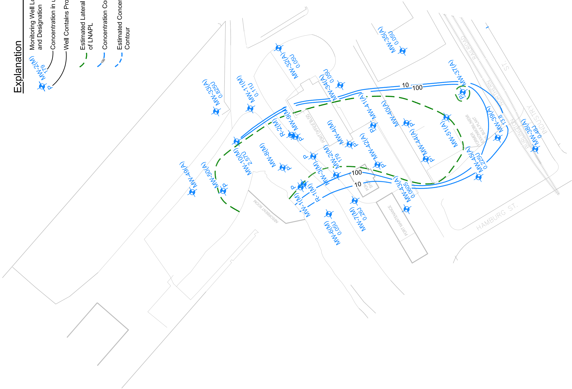
Key Plan - AOC 4